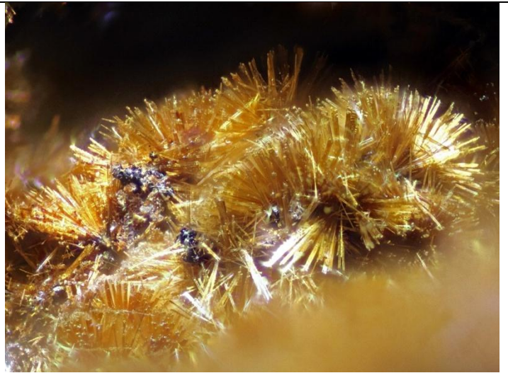
Eleonorite Chickering Mine, Walpole, NH 1.1 mm field of view