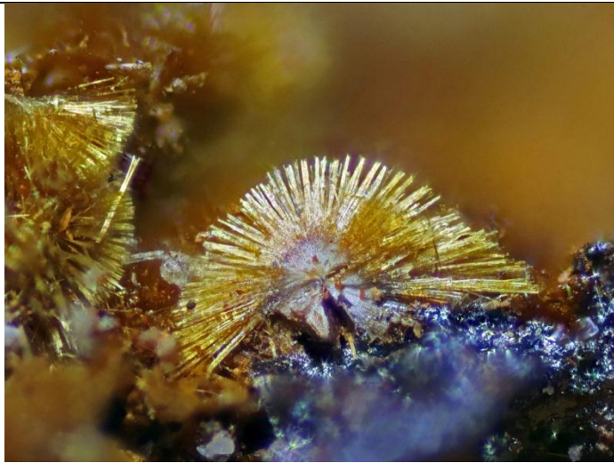
Eleonorite Chickering Mine, Walpole, NH 0.7 mm eleonorite fan.