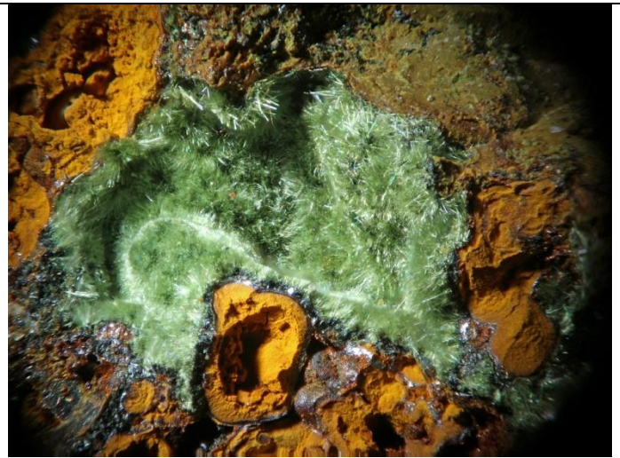
Beraunite Palermo #1 Mine, N. Groton, NH 6 mm field of view.