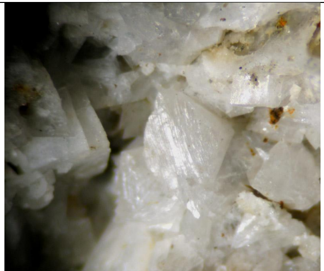
Orthoclase var Adularia, Crystals to 3 mm Exit 8 – Amherst St. Nashua, NH