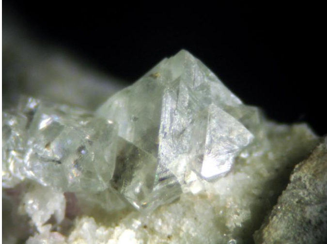
Fluorite. Largest crystal 3 mm Rt. 93 Exit 10 Merrimack Industrial Interchange, Merrimack, NH

Below are some photos of my finds. I would have liked to include a photo of the Stilbite specimen, but despite many tries, I could not get a satisfactory image of the clear stilbite crystals on the milky calcite background.