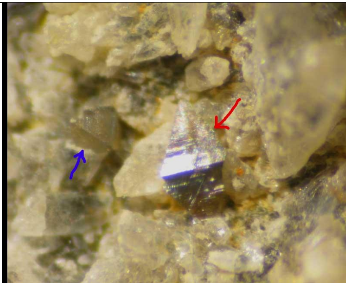
Anatase, 2 xls. Larger, red arrow, 0.8 mm. Exit 8 – Amherst St. Nashua, NH